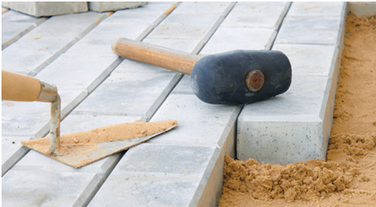
Paving, Kerbs & Channels