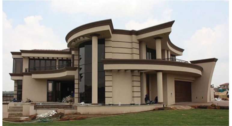
Complete Building Construction