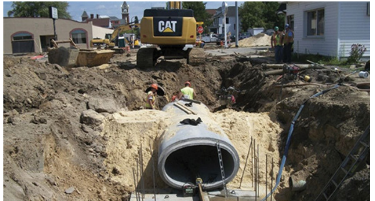
Storm Water Construction